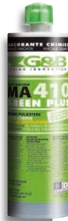
MA GREEN PLUS