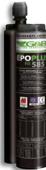
GEBOFIX EPO PLUS RE