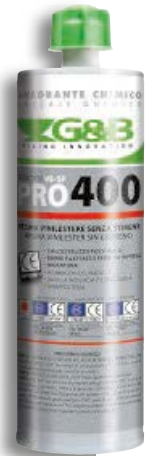
GEBOFIX VE-SF PRO